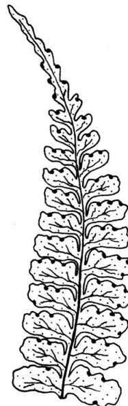
Figure 2. Dennstaedtia rectangularis : pinnule detail ( W. Burger & R. Stolze 5273 (CR)).

6) Additional revised material: COSTA RICA. San José: Vásquez de Coronado, La Hondura, 1400 m, 20 Jul 1927, M. Valerio 173 "32802" (CR).