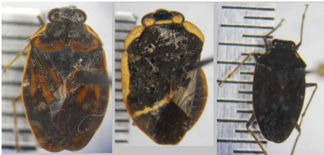
Figure 1. Female specimens of Ochteridae, from left to right; Ochterus manni from Costa Rica, San José, San Pedro; Ocyochterus victor from Nariño, Colombia and Ochterus viridifrons from Costa Rica, Guanacaste, Bagaces, Llanos de Cortés. Minimum scale: 0.50 mm.

Thanks to IdeaWild.org and MZUCR for their support; to the Sistema Nacional de Áreas Protegidas (SINAC) for the