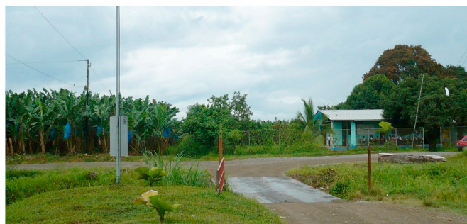
Fig. 3. Students receiving lectures outside classrooms because the hot climate, Matina County, Costa Rica.

higher than concentrations reported in external air by Morgan et al. (2005). In contrast, median concentrations in non-proximal schools were about three times lower than the concentrations for internal air and slightly higher than the concentrations reported for external air, respectively, reported by Morgan et al. (2005). These differences can be explained by distinct use of chlorpyrifos, which in our study was external, outside schools on banana plantations, whereas in the study by Morgan et al. (2005), use was inside schools to control insects.