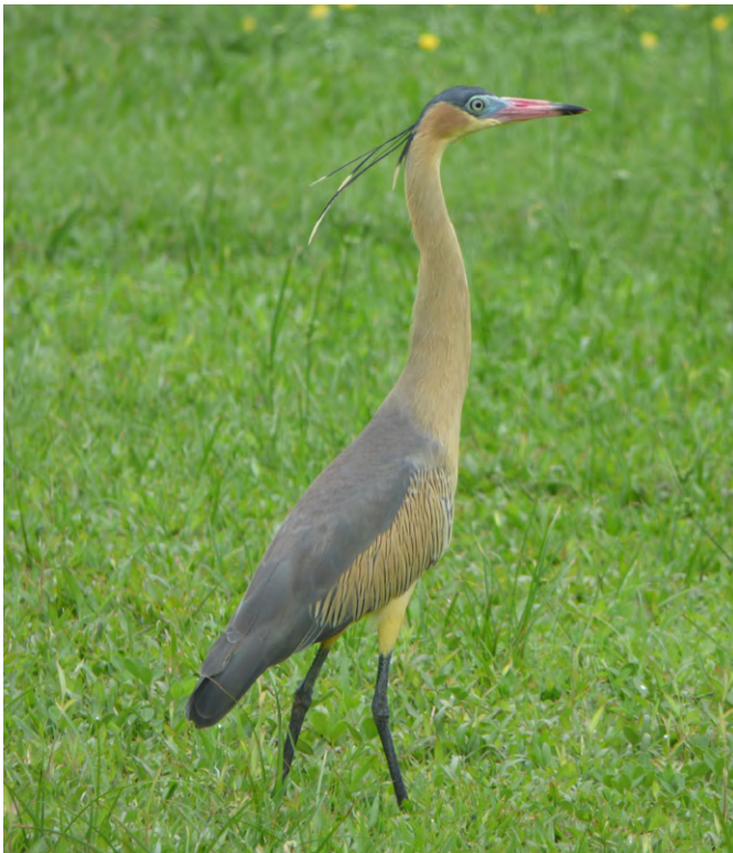
Figure 2. Syrigma sibilatrix in the soccer field at Manzanillo, Limon province, Costa Rica, 16 February 2016.

2012). However, a gradual expansion in its range could be occurring, possibly associated with habitat loss by agriculture, as well as other human-induced landscape changes (Blamires et al. 2005; Dean 2012).