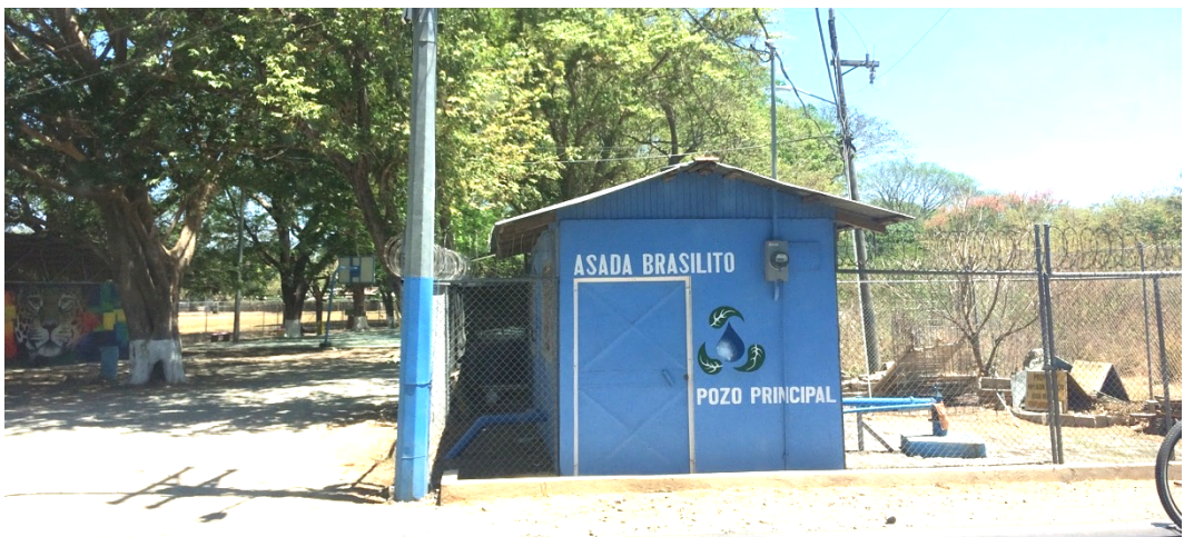
The main groundwater well in Brasilito that is used to deliver drinking water at 5 l/s to the local community and touristic hotels in the town

Brasilito is a small town in the Guanacaste province, known as budget location for tourists on the Pacific side of the country. The water supply to the inhabitants and local hotels is managed by the local ASADA, which operates three groundwater extraction wells. Due to very low precipitations falling during the dry season, the groundwater levels in the Brasilito area declined, which further led to increased intrusion of saline water into the underlying aquifer. The project team met the representatives of CEMEDE-UNA and ASADA Brasilito and discussed about the impact of saltwater intrusion on the local water supply system.