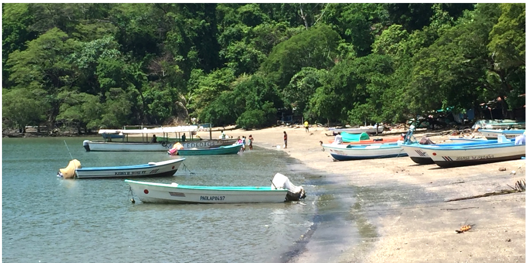
During the dry season, the local communities living on the islands of the Nicoya peninsula are severely affected by freshwater scarcity

Costa Rica is a water-blessed country with abundant rainfalls oscillating annually between 1,300 and 7,500 mm. A full set of measures and policies made Costa Rica globally famous for the success of its environmental protection efforts. This ecological commitment ranked the country on top of Latin American and Caribbean countries on the protection of human health and ecosystems. In 2015, the country also achieved 99% of its energy generation from renewable sources, an important milestone in its plan to go carbon neutral by 2021. But this highly privileged status on environmental protection received serious challenges when regarded from the perspective of sustainable water management. One of the main issues of concern relates to the high rainfall seasonality in the North Pacific Region, which increases dramatically the pressure on available freshwater resources. While some issues are currently being addressed at national level, at regional level the country is facing increased pressure from pollution of surface water, from seasonal water scarcity (for example in the Pacific insular communities) and from saltwater intrusion in north-western coastal areas such as Guanacaste province, which are exposed to an increased urban development and concentrated tourism.