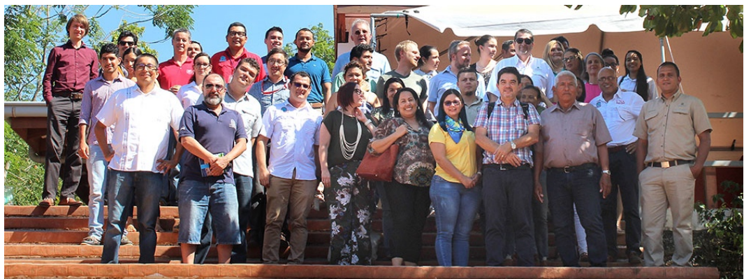
Group photo with the participants of the workshop “Green adaptation strategies for water security in the Central American dry corridor” organised by researchers from Universidad Nacional Costa Rica and Technische Universität Dresden, Germany, in Nicoya, Guanacaste peninsula, on 26 March 2019.