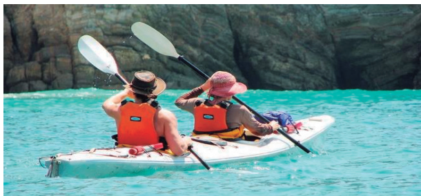
Figure 1. Kayaking in Playa Tambor, Costa Rica.

Seascope has been offering unique, small-group sea kayaking experiences since 1994. The company built its reputation on exceptional quality, extensive experience, high safety standards, personalized, friendly service, and a strong commitment to the culture, history and natural