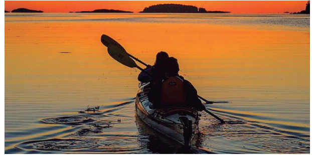
Figure 2. Kayaking in Deer Island, Canada.

environment of each of its areas of operation (See Figures 1 and 2). According to Bruce, “We specialize in small group travel, which minimizes environmental impact, increases safety standards and allows for personalized, enriching and authentic experiences.” In 2016, the Expedia site named Seascope one of the top 15 eco-adventures in Canada (Expedia, 2016).