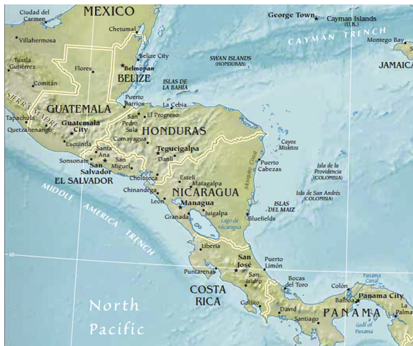
Figure 1. Geographic region known as Mesoamerica includes Southeastern Mexico, Guatemala, Belize, El Salvador, Honduras, Nicaragua, Costa Rica, and Panama. Image adapted from the CIA World Factbook map of Central America. 12

Three international workshops have been conducted in Central America since 2005, under the auspices of the Program on Work, Health and Environment in Central America (SALTRA), 26-28 as well as the National Autonomous University of Mexico. 27 Much of this review is based on the discussions and results of these workshops, especially the First International Research Workshop on the Mesoamerican Nephropathy, held in November 2012 in San José, Costa Rica. 28,29 The epidemiologists, clinicians, and public health professionals who participated in the workshops emphasized that this disease does not follow expected patterns of usual or commonly known kidney disease, such as kidney disease linked to diabetes or hypertension. Instead, they confirmed