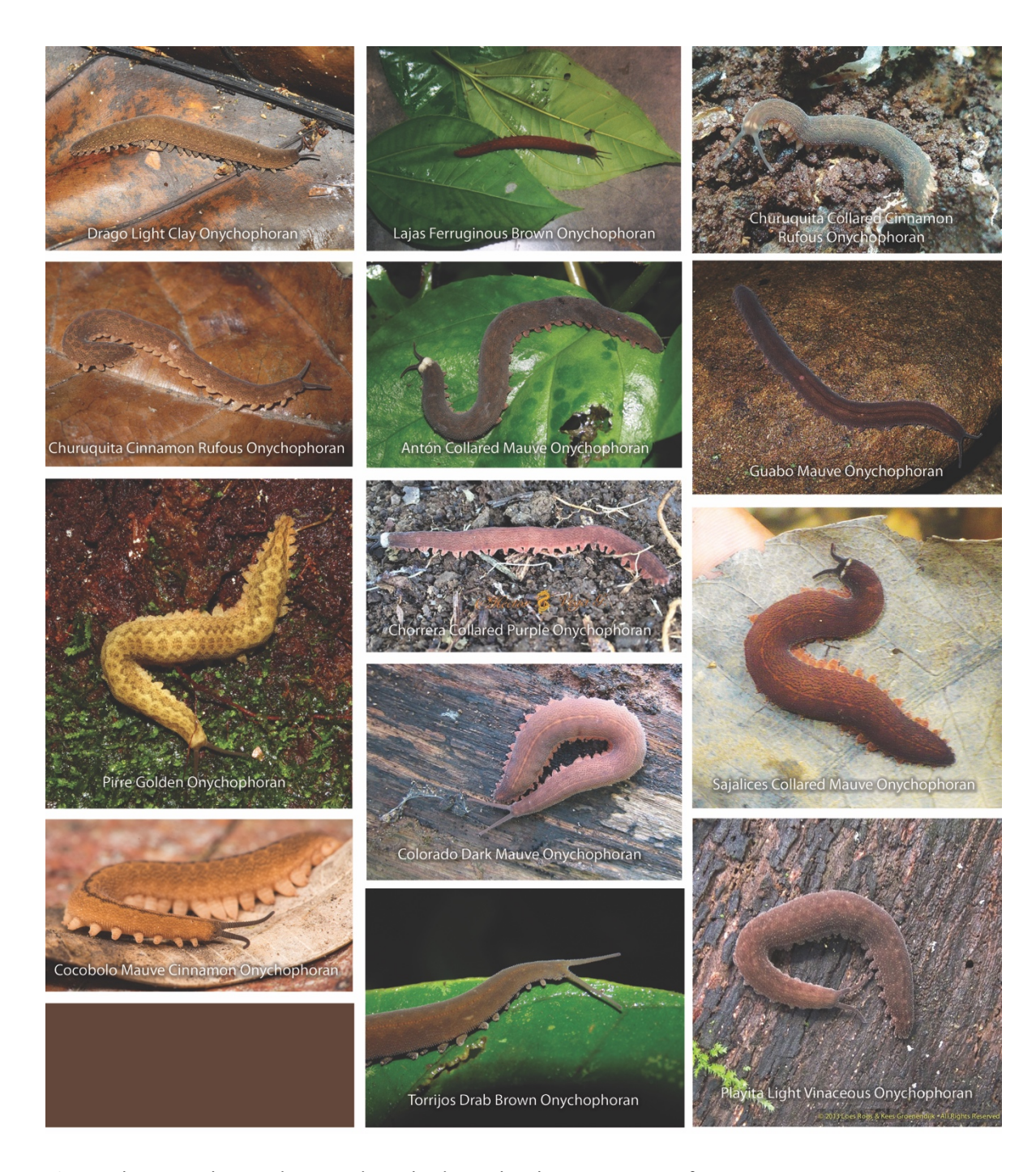
Fig. 2. Photographic guide to undescribed onychophoran species of Panama.