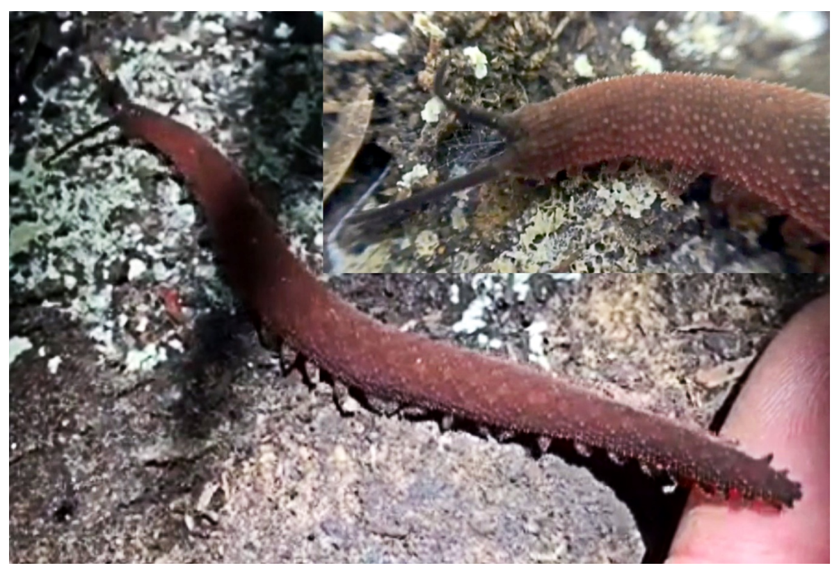
Fig. 5. Castillo Vinous Onychophoran.