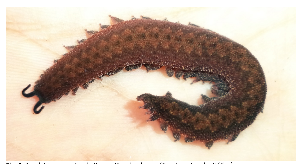
Fig. 4. Amak Nicaragua Sandy Brown Onychophoran.