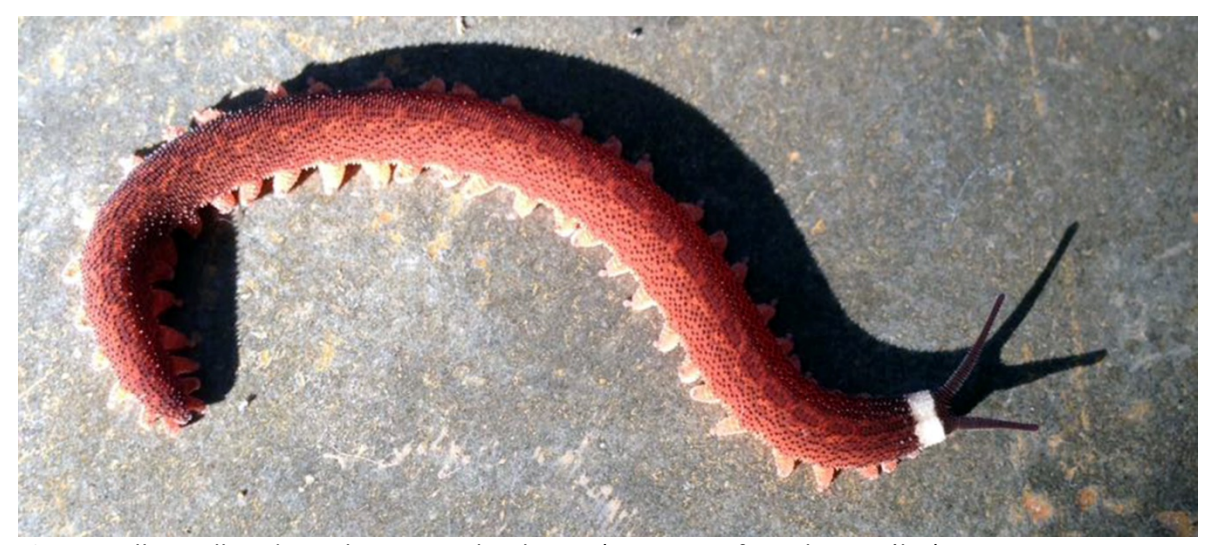
Fig. 3. Biolley Collared Raspberry Onychophoran (Courtesy of Frank González).