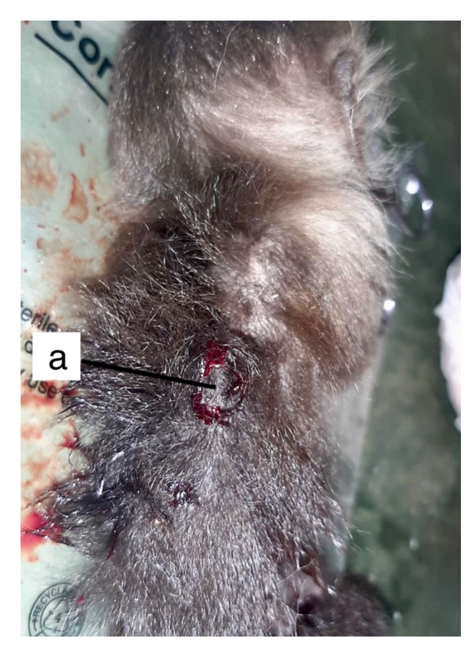
Fig. 2 Wounds on LL-21 following the infanticide and cannibalism events: (a) bite on the right side of the thorax adjacent to the vertebral spine

Female-initiated infanticide occurs more often in communally breeding species, those with high maternal investment, and in species with temporal birth peaks that occur when resources for offspring are limited (reviewed in Lukas and Huchard 2019). Although infanticide by females has not been reported in C. imitator before, it is possible that until now it has gone unwitnessed by observers. Indeed, many primate species were initially thought not to exhibit infanticide, but with increasing length of intensive study, these